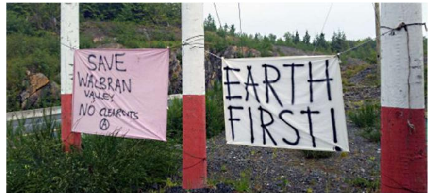
Above: Banner drop on Hwy 14 near Port Renfrew, BC